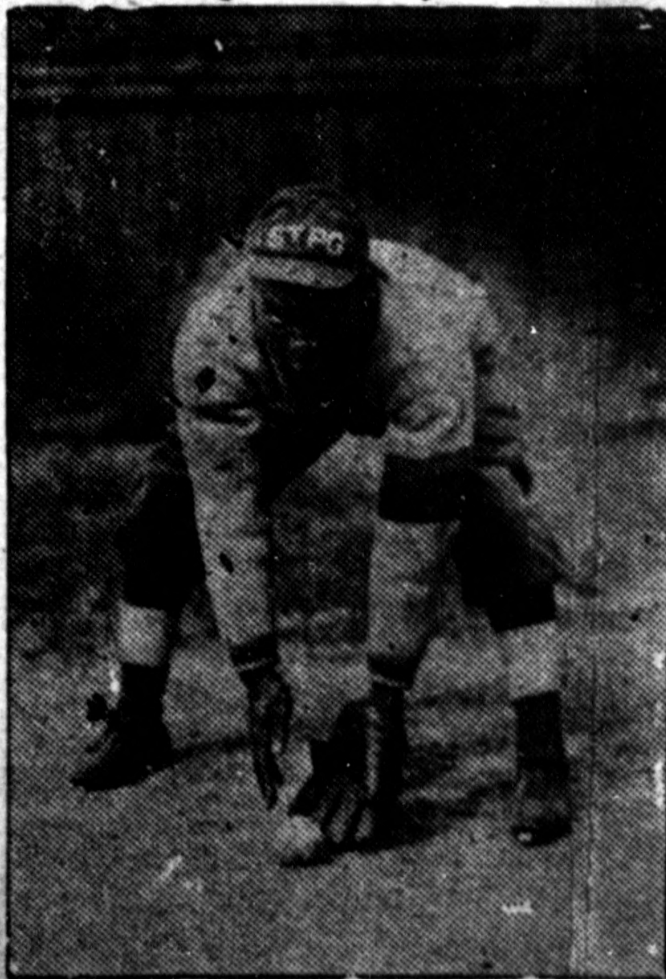
WALLACE The king of infielders.